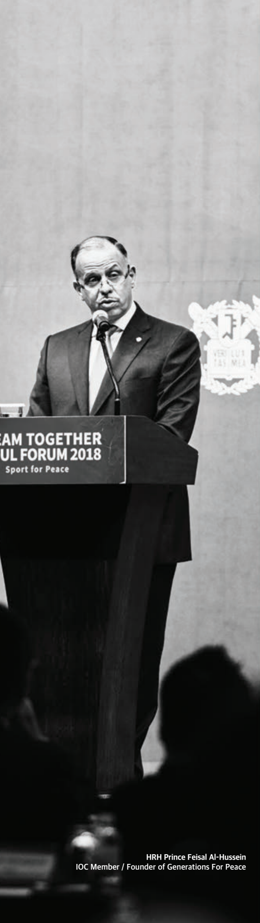
HRH Prince Feisal Al-Hussein IOC Member / Founder of Generations For Peace